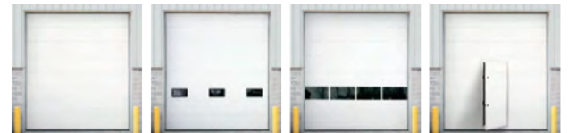
MODEL U100 closed door